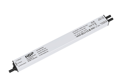
DIMMABLE POWER SUPPLY

POWER SUPPLY DC 48V 100W 2,1A IP 67 DALI2/PWM Cod: MID0032