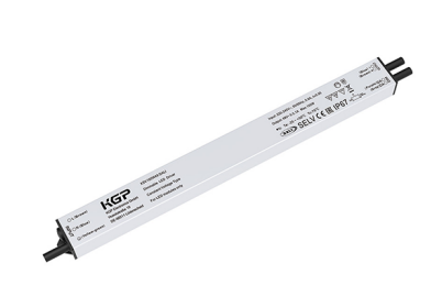
DIMMABLE POWER SUPPLY

POWER SUPPLY DC 48V 100W 2,1A IP 67 DALI2/PWM Cod: MID0032