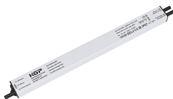
DIMMABLE POWER SUPPLY POWER SUPPLY DC 48V 160W 3,34A IP 67 DALI2/PWM Cod: MID0033