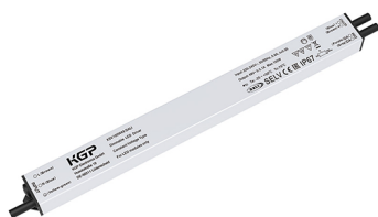
DIMMABLE POWER SUPPLY POWER SUPPLY DC 48V 100W 2,1A IP 67 DALI2/PWM Cod: MID0032