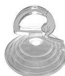
EXTRACTION KIT Suction cup for VITRUM 1 Cod: VITZZ009