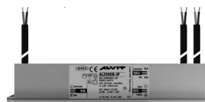
DIMMABLE POWER SUPPLY Power supply 220/240 50/60Hz 24V 24W IP67 DALI Cod: MID0021