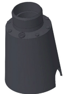
DRAINING OUTERCASE Outercase draining VITRUM 1 Cod: VITZZ000