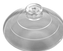
EXTRACTION KIT Suction cup for VITRUM 3 Cod: VITZZZ011