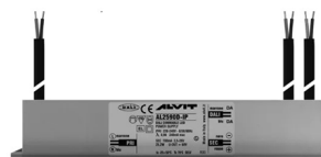
DIMMABLE POWER SUPPLY Power supply 220/240 50/60Hz 24V 24W IP67 DALI Cod: MID0021