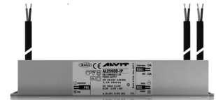
DIMMABLE POWER SUPPLY

Power supply 220/240 50/60Hz 24V 24W IP67 DALI