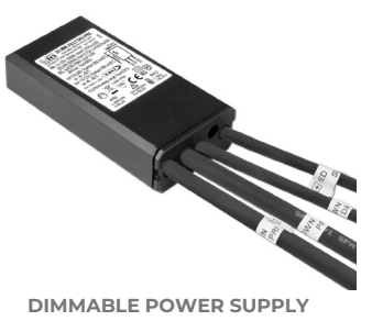
POWER SUPPLY DC 2-49V 1/30W 250-700MA IP68 DALI Cod: MID0027