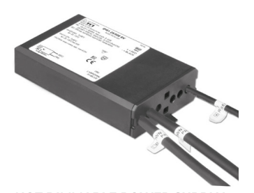
NOT DIMMABLE POWER SUPPLY POWER SUPPLY DC 10-50V 15/70W 700MA IP68 Cod: MID0026