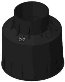
DRAINING OUTER CASE